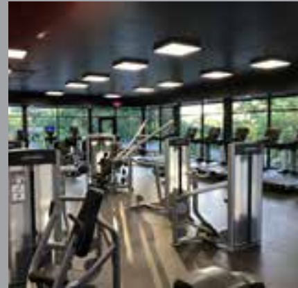
Wintergarden Fitness Center

The process involved in removing one surface and replacing it with another was extensive, detailed, and labor intensive. Be sure to thank Fred and his crew for their efforts and diligence if you have a chance. In addition to the work on the surrounds, all the bunkers were edged and cleaned up to provide the finishing touches to this project. The grow-in of the new green surrounds should be completed by late September, and the Monocan Nine should be ready to reopen for play in mid-September. See you on the course!