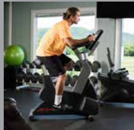
Stoney Creek Fitness Center