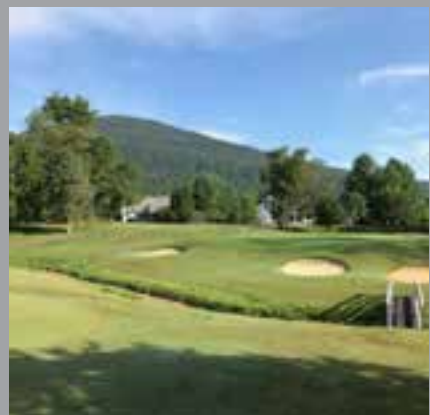
Monocan Greens Surrounds