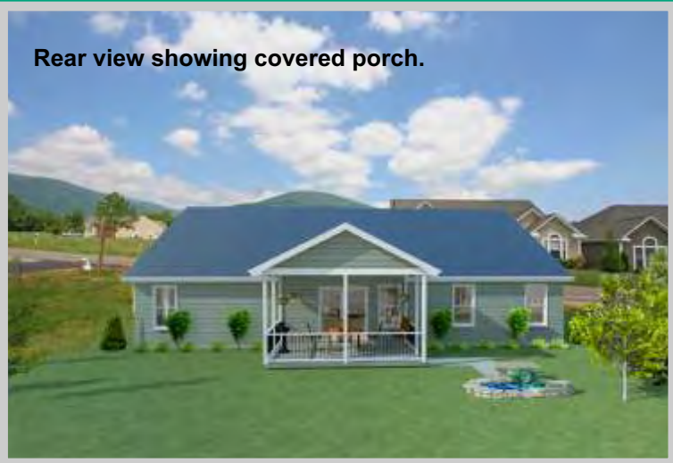
Rear view showing covered porch.

We will work with you to choose the options that fulfill your dreams.